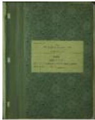
Maritime College Alumni Association Meeting Minutes Volume 1, December 10, 1937 to October 10, 1968 (CA-RG12-0001-01)