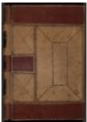
Sailors' Snug Harbor Board of Trustees Minutes Book A, with records of Board proceedings from April 1806 - January 1841 (SC-0016-II-2-A)