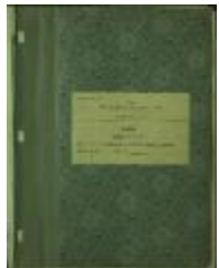
Maritime College Alumni Association Meeting Minutes Volume 1, December 10, 1937 to October 10, 1968 (CA-RG12-0001-01)