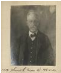
Allen W. Smith Photograph (SSHB2_pg19_photo1419.jpg)