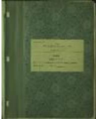
Maritime College Alumni Association Meeting Minutes Volume 1, December 10, 1937 to October 10, 1968 (CA-RG12-0001-01)