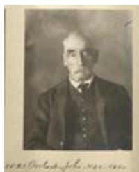
John Orchard Photograph (SSHB2_pg27_photo1521.jpg)