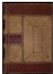
Sailors' Snug Harbor Board of Trustees Minutes Book A, with records of Board proceedings from April 1806 - January 1841 (SC-0016-II-2-A)