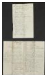
Petition from Inmates, April 9, 1872 (SC-0016-I-D-1-A-063)