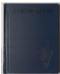
1998 Eight Bells Yearbook (CA-RG9-0001-1998)