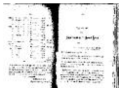
New York Nautical School Annual Report, 1876 (CA-RG9-0003-1876)