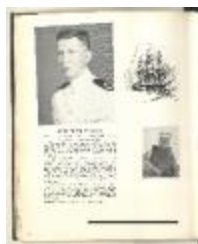
1954 Eight Bells Yearbook (CA-RG9-0001-1954)