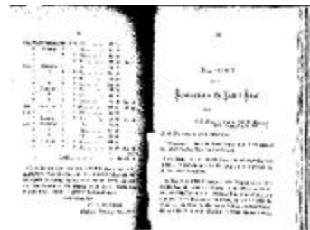
New York Nautical School Annual Report, 1876 (CA-RG9-0003-1876)