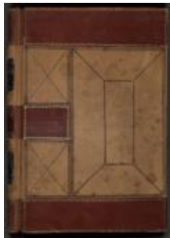
Sailors' Snug Harbor Board of Trustees Minutes Book A, with records of Board proceedings from April 1806 - January 1841