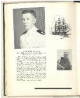
1954 Eight Bells Yearbook (CA-RG9-0001-1954)