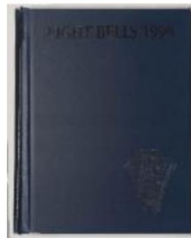
1998 Eight Bells Yearbook (CA-RG9-0001- 1998)