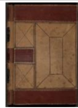
Sailors' Snug Harbor Board of Trustees Minutes Book A, with records of Board proceedings from April 1806 - January 1841