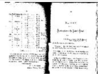
New York Nautical School Annual Report, 1876 (CA-RG9-0003-1876)