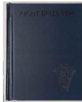
1998 Eight Bells Yearbook (CA-RG9-0001-1998)