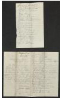
Petition from Inmates, April 9, 1872 (SC-0016-I-D-1-A-063)