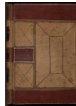
Sailors' Snug Harbor Board of Trustees Minutes Book A, with records of Board proceedings from April 1806 - January 1841