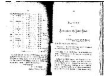
New York Nautical School Annual Report, 1876 (CA-RG9-0003-1876)