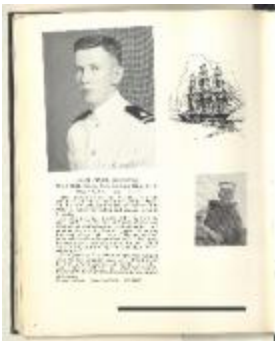
1954 Eight Bells Yearbook (CA-RG9-0001-1954)