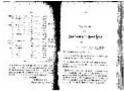
New York Nautical School Annual Report, 1876 (CA-RG9-0003-1876)