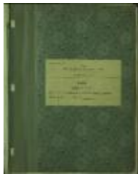
Maritime College Alumni Association Meeting Minutes Volume 1, December 10, 1937 to October 10, 1968 (CA-RG12-0001-01)