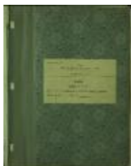
Maritime College Alumni Association Meeting Minutes Volume 1, December 10, 1937 to October 10, 1968 (CA-RG12-0001-01)