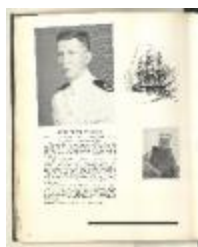
1954 Eight Bells Yearbook (CA-RG9-0001-1954)