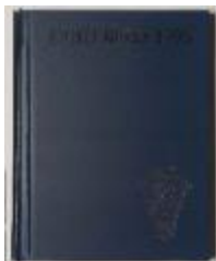
1998 Eight Bells Yearbook (CA-RG9-0001-1998)