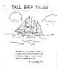
Tall Ship Tales (TallShipTales)