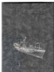
1995 Eight Bells Yearbook (CA-RG9-0001-1995)