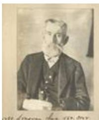
Charles Donovan Photograph (SSHB2_pg8_photo1289.jpg)