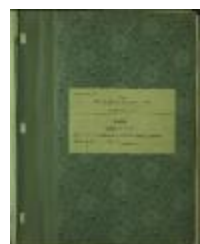
Maritime College Alumni Association Meeting Minutes Volume 1, December 10, 1937 to October 10, 1968 (CA-RG12-0001-01)