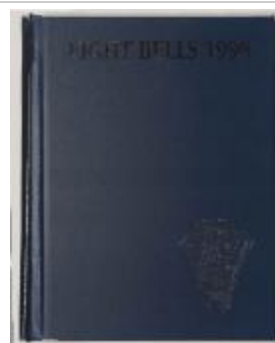
1998 Eight Bells Yearbook (CA-RG9-0001-1998)