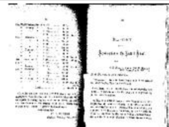
New York Nautical School Annual Report, 1876 (CA-RG9-0003-1876)