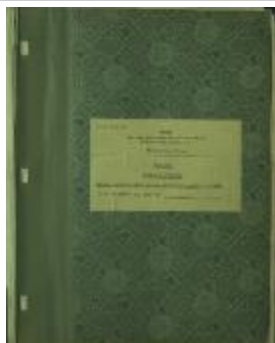
Maritime College Alumni Association Meeting Minutes Volume 1, December 10, 1937 to October 10, 1968 (CA-RG12-0001-01)