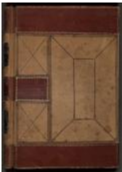
Sailors' Snug Harbor Board of Trustees Minutes Book A, with records of Board proceedings from April 1806 - January 1841 (SC-0016-I-D-1-A-063)