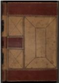
Sailors' Snug Harbor Board of Trustees Minutes Book A, with records of Board proceedings from April 1806 - January 1841 (SC-0016-I-D-1-C-0001)