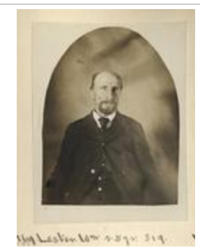
William Lester Photograph (SSHB1_pg15_photo169.jpg)