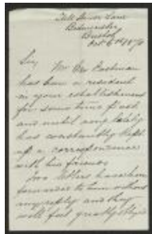
Letter from Robt. [Robert] S. Cole, October 6, 1870 (SC-0016-I-D-1-A-042)